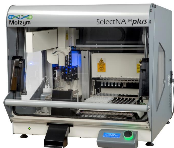
Fig. 2 The SelectNA™plus robot for the automated host DNA depletion and extraction of microbial DNA.

The newest development is a fully automated system comprising the SelectNA™plus robot which is run with the MolYsis-SelectNA™plus kit and can be used for ≤1 ml liquid and 0.25 cm 2 tissue samples (Fig. 2). Handling is limited to the loading of the instrument with cartridges, other consumables and the samples. One to 12 samples can be processed by the instrument at a time. The kits above have been used for NGS analyses of various specimens, including urinary encrustations, necrotized hepatic tissue, rabbit organ biopsies as well as fluid samples like EDTA blood and broncho-alveolar lavage (Table 1).